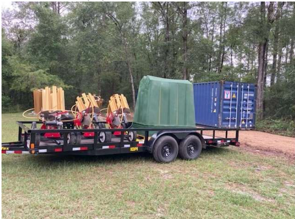
The 5 stand equipment and conex have arrived!