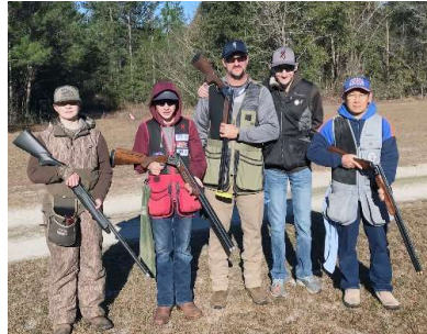
Squad 2 posing for the camera