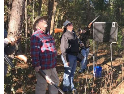
Focusing on a high crosser