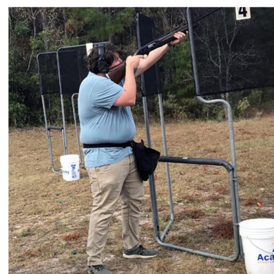
Emory focuses on a high crosser