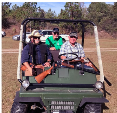
Ridin' in Style!