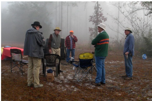
Heavy fog means a delayed start

Our next event is scheduled for February. Look for an announcement on the website and across the range.