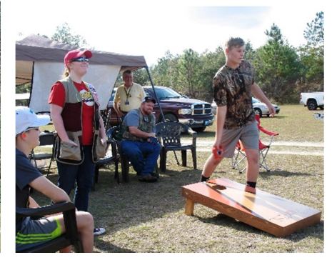
Great food and plenty of it