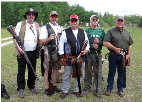
Squad 3 prepares to take on the course